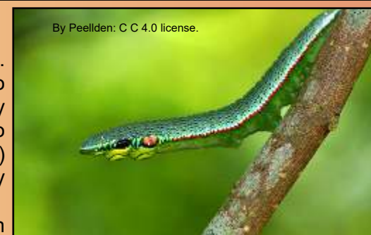
By Peellden: C C 4.0 license.