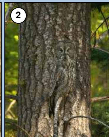
By Art Wolfe CC BY-NC-SA 3.0 DE