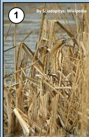
By Sciadopitys: Wikipedia