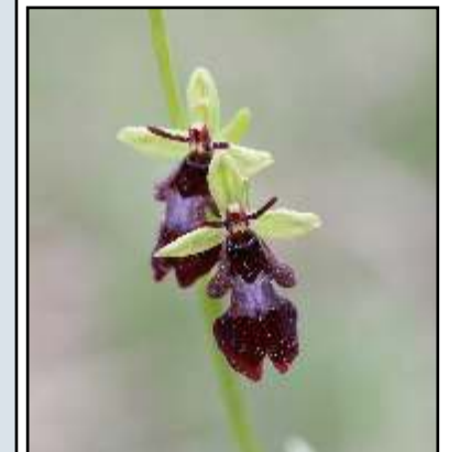
Two fly orchids

Some orchids look and smell like insects to trick bees and other insects which are necessary to pollinate them. It seems impossible that these orchids could have evolved gradually. We believe that God created them this way.