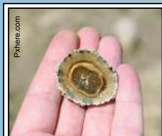
A Limpet's suction foot.

Have you ever explored rock pools at the seaside? If so, you may have seen limpets (left) — a type of sea snail that clings to the rocks. Although limpets are quite small, their bodies are not at all simple. Inside their shell they have muscles, gills, nerves, kidneys, a heart and stomach. They have 100 rows of teeth! Although the teeth are very hard, they wear out quickly, but new ones then grow in their place. Their teeth are so strong that human engineers believe they can copy this material to make stronger cars, boats and aircraft.