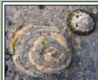
A living limpet with a fossil. There has been no evolution.

Lots of limpet fossils have been found around the world, but the fossilized ones look the same as limpets that are living now, so there is no evidence they have evolved. Limpets are one of the wonders of God's creation, created by Him, and perfectly designed for the life they live. — Geoff Chapman