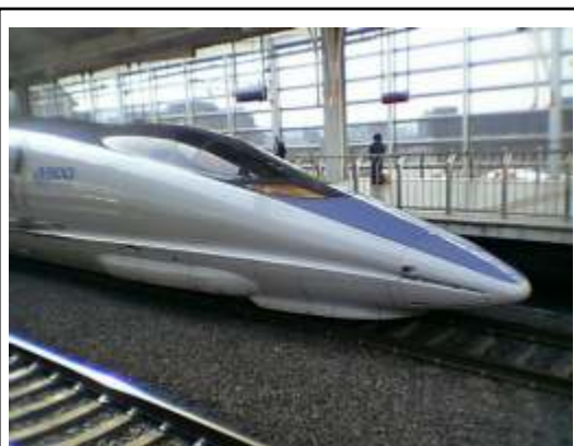
The Japanese Bullet Train

noticed how kingfishers slice through the air (right) and into the water with hardly a splash. This is because of the way the birds’ beak is designed. So the train engineers re-designed the front end of the train to mimic the shape of the kingfisher’s beak. The new design meant that the train was quieter, and there was no longer a boom when the train went through tunnels. It could also travel faster while using less electricity.