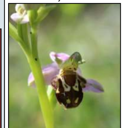
A bee orchid